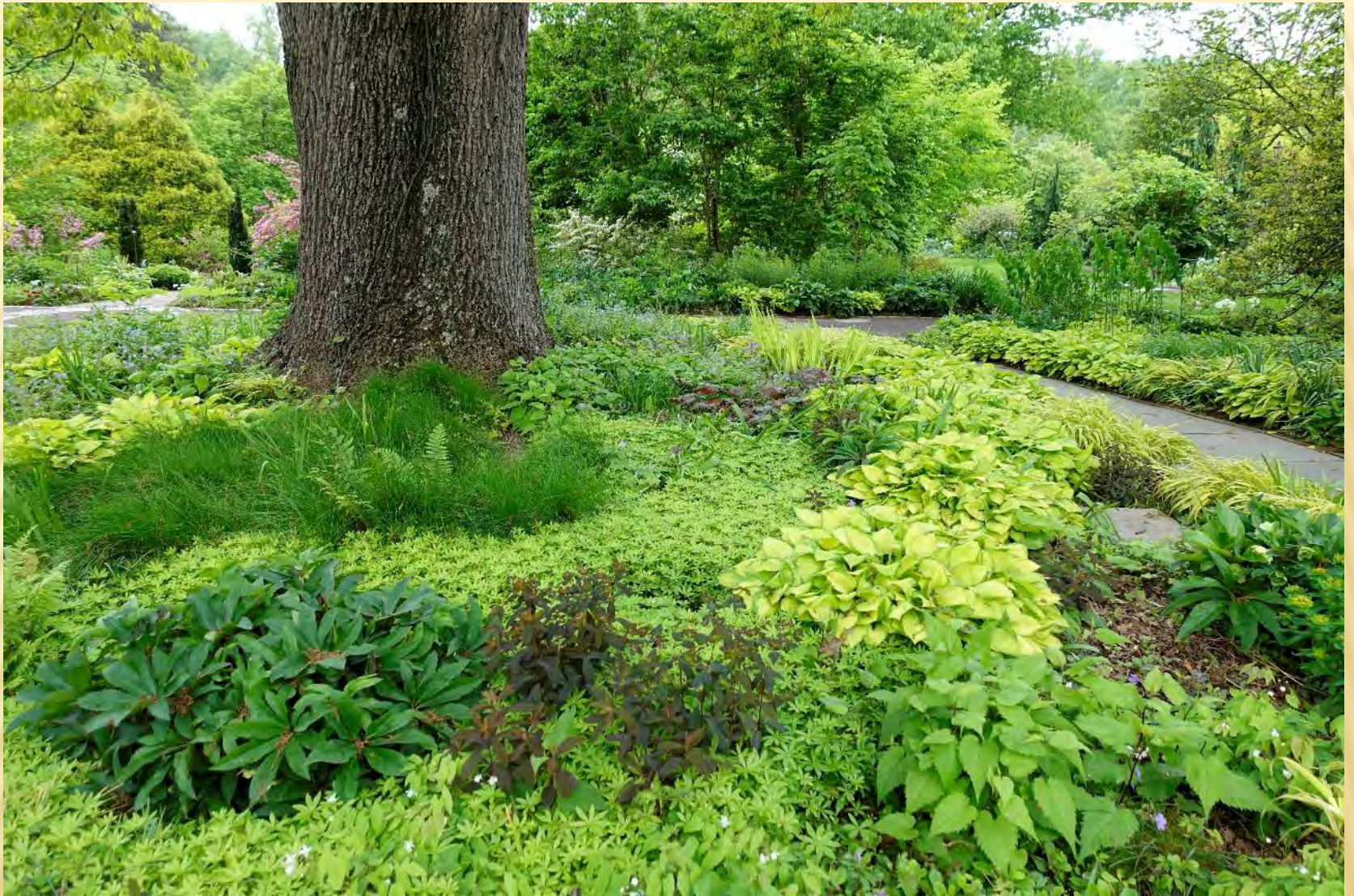
Chanticleer Garden, Wayne, PA